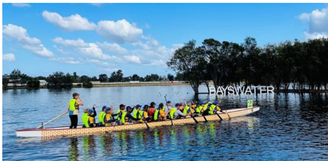
Bond to Bayswater Belter