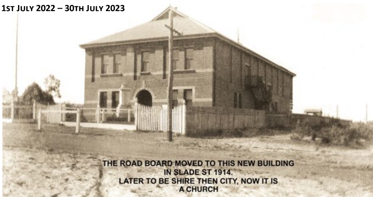
THE ROAD BOARD MOVED TO THIS NEW BUILDING IN SLADE ST 1914. LATER TO BE SHIRE THEN CITY, NOW IT IS A CHURCH