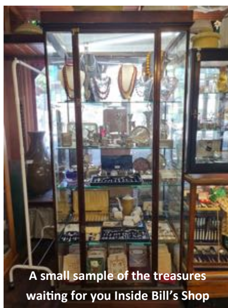
A small sample of the treasures waiting for you Inside Bill's Shop