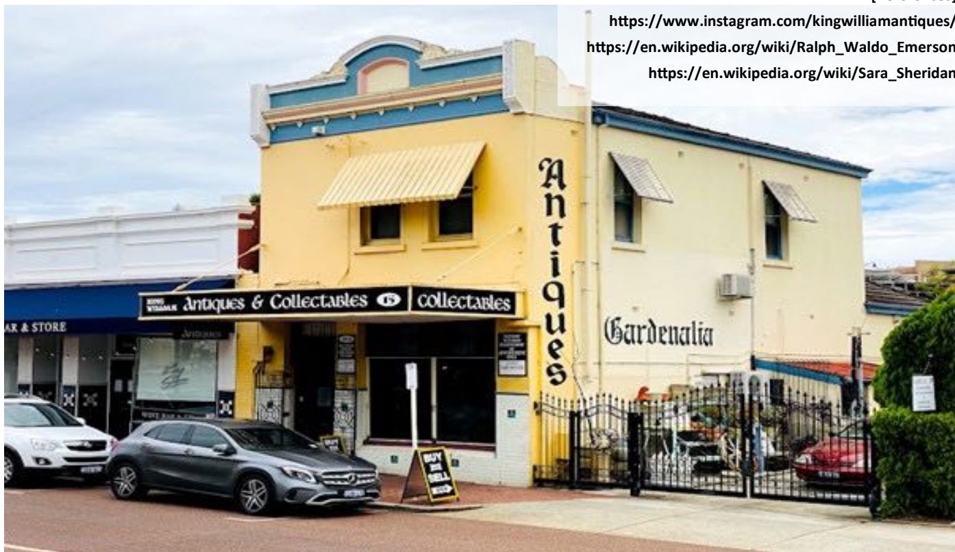
King William Antiques. 15 King William Street BAYSWATER Western Australia Open 10.30 - 4.00 THURS, FRI, SAT, and SUN. Other days by appointment only. Phone +61409887622