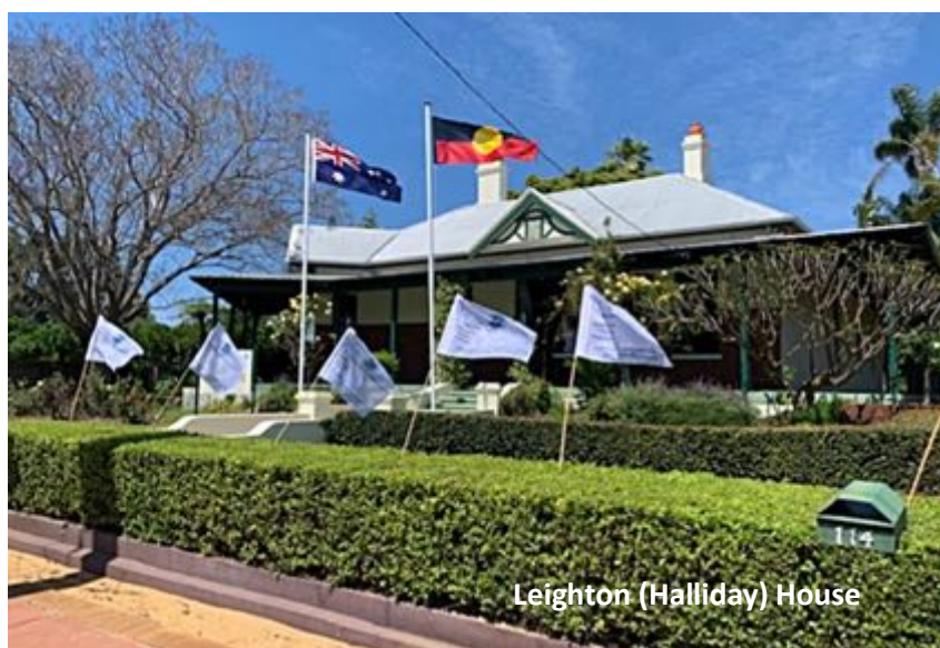
Leighton (Halliday) House

Facebook and Instagram@bayswaterhistoricalsociety